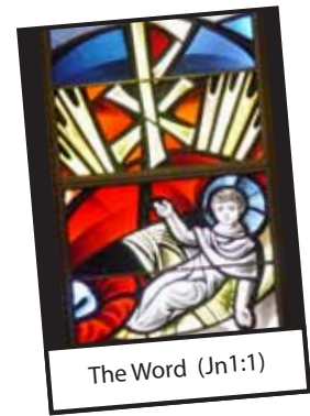
The Word (Jn1:1)